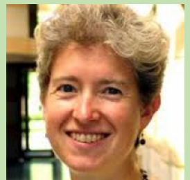
Friday 10:45-11:45 am

NOTE: All featured events will take place in the Haslam Business Building, room 104, and be open to the public.