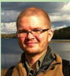
Thursday 1:30-2:30 pm