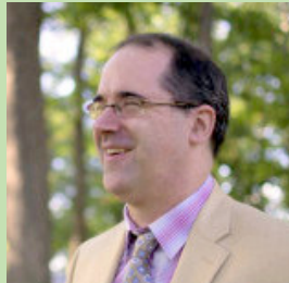
Thursday 11:00-12:00 pm