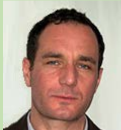
Friday 12:00-1:00 pm